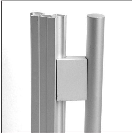
1_ Rod handle for S1500